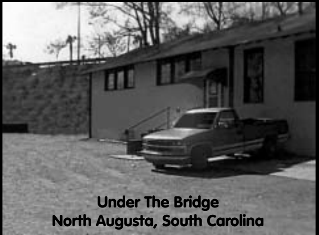
Under The Bridge North Augusta, South Carolina